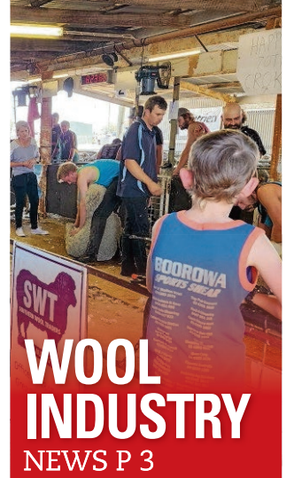
WOOL INDUSTRY NEWS P 3