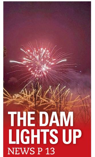
THE DAM LIGHTS UP NEWS P 13

"Landholders prepare the planting sites, provide the trees and are on-site to assist, whilst Hilltops Council support by sponsoring a 'Thankyou Dinner' on the Saturday night."