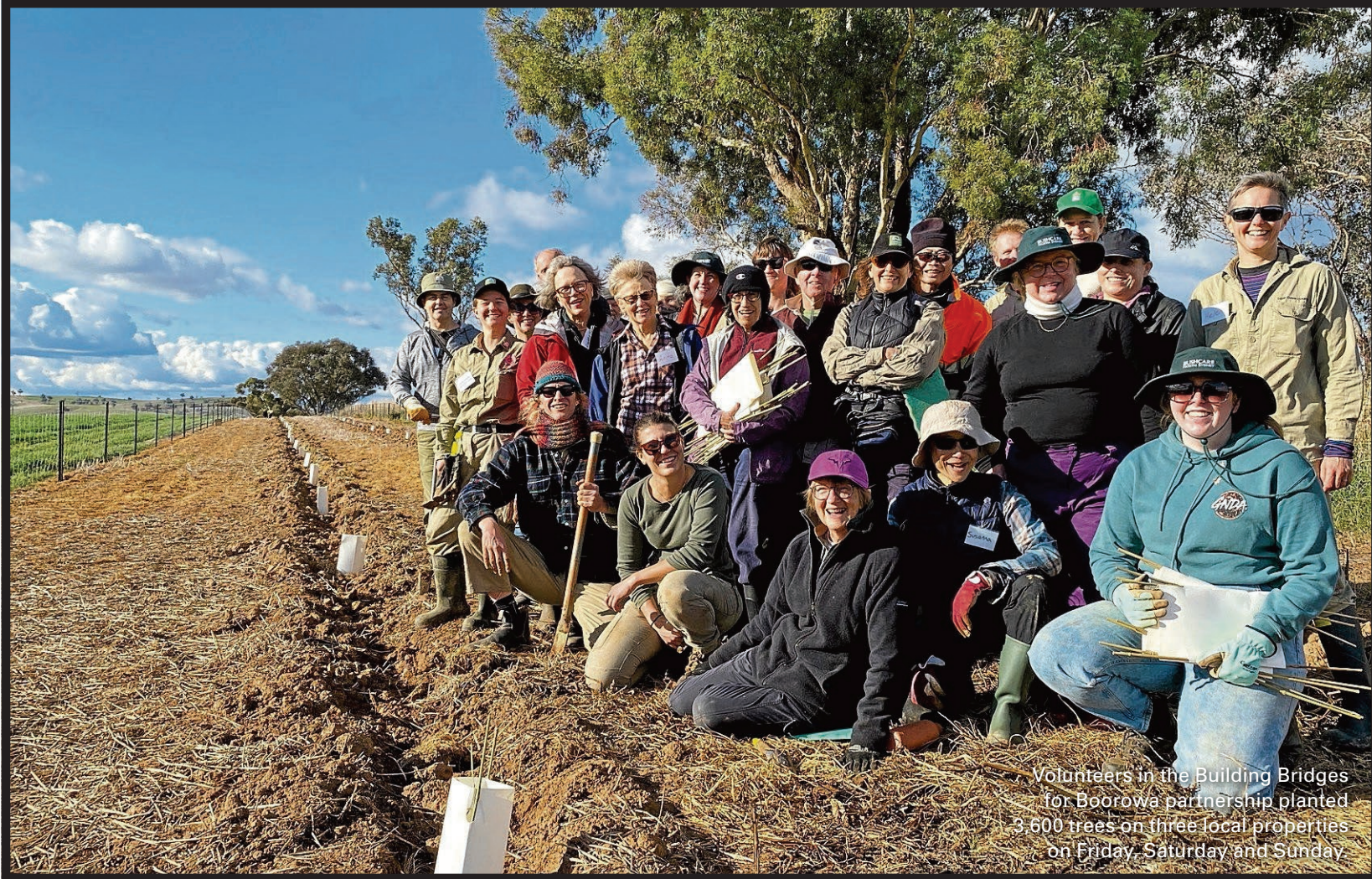
Volunteers in the Building Bridges for Boorowa partnership planted 3,600 trees on three local properties on Friday, Saturday and Sunday.

CIRCULATING IN THE BOOROWA DISTRICT SINCE 1874